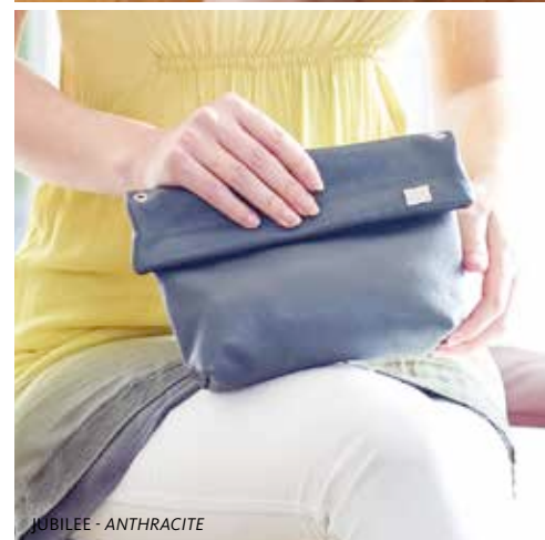
JUBILEE - ANTHRACITE