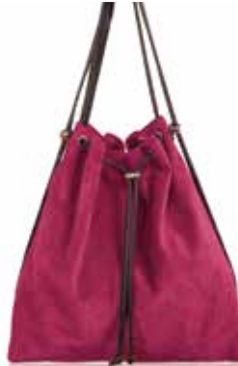
MATHILDE - PASSION

H36, W34, D10cms Skins Available: Lg, Lc, H