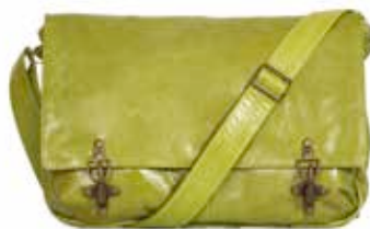
TNG - GRANNY SMITH

Designed by Emily Eavis - the attention to detail is outstanding, multiple pockets, zip fastening, soft adjustable strap, suede backed flap, this is Somerset craftsmanship at its very best.