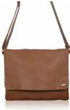
MESSENGER - PECAN

Three compartments, huge zipper areas, this is a super cool messenger in glorious bison leather – love it, love it, love it!