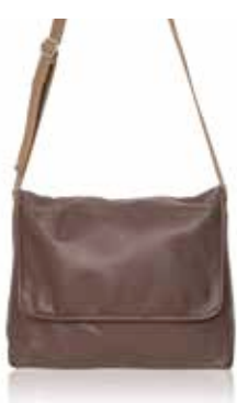
ALEX - BRANDY

Su: Suede | Lg: Leather Glacé | Lc: Leather Classic | Bi: Bison Leather | H: Hair-on