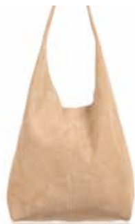
POCKET SLOUCH - ICED COFFEE

H22, W24, D12cms Skins Available: Su, Lg, Lc, Bi, H