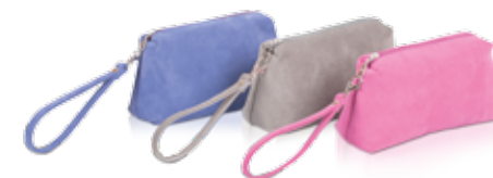
TIGRES - SUEDE The quintessential handbag tidy, come clutch bag, come purse, come cosmetic bag – shown above with a thin wrist strap. H14, W23, D9cms Skins Available: Su, Lg, Lc, H