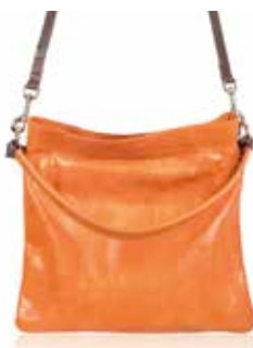
IGGY - ORANGE This quirky bag can be worn three ways. Iggy features 2 detachable handles and a large inside zip pocket. H28, W30cms Skins Available: Su, Lg, Lc, H