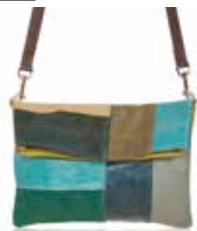
HYBRID - VARIOUS

H27, W36, D9cms Skins Available: Su, Lg, Lc, Bi, H