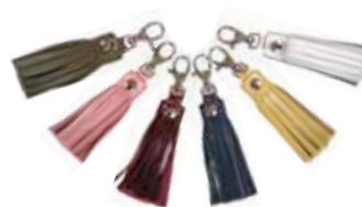
KEYRINGS - TASSLES Add an eye catching pop of colour and style to your keys – striking, tactile and fun (sold in packs of ten). H12, W3, D1cms Skins Available: Su, Lg, Lc