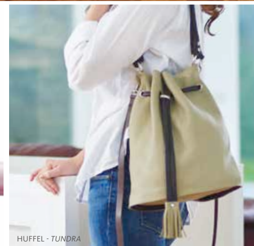
HUFFEL - TUNDRA