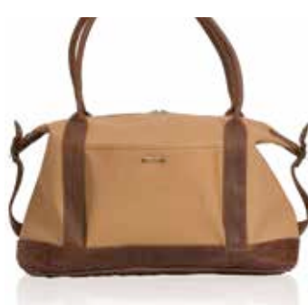
GRIP - CANVAS

H34, W22, D5cms Skins Available: Su, Lg, Lc