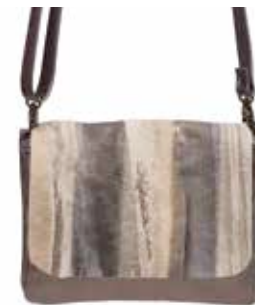
REMUS - PANDORA / TIN Delightful OBL combo bag featuring three compartments and a detachable adjustable strap – the perfect micro bag/clutch. H16, W19, D4cms Skins Available: Su, Lg, Lc, H