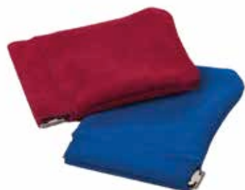
SQUEEZE - LEATHER This snap top coin purse is just so handy (even fellas use them) great value & great fun (sold in packs of ten). H11, W9cms Skins Available: Su, Lg, Lc, H