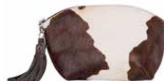
BOHO LARGE - ASSORTED COWHIDE Multi purpose = clutch, handbag tidy, small wash bag, voluminous & stylish (sold in packs of three). H12, W20, D6cms Skins Available: Su, Lg, Lc, H