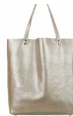
KEINTON - OLD MIRROR

H42, W39, D10cms Skins Available: Lg, Lc, H