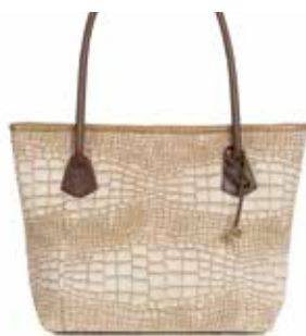
HURDLER - ARIEL

Classic – perfect size for both shoulder and tote, capacious and ageless.