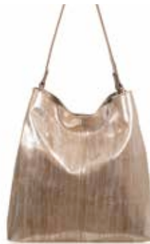
DILLIE - NEVADA

H29, W37, D14cms Skins Available: Su, Lg, Lc