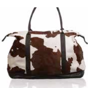
WORKSHOP - BROWN SPLASH

H26, W32, D13cms Skin Available: Veg-Tan Only