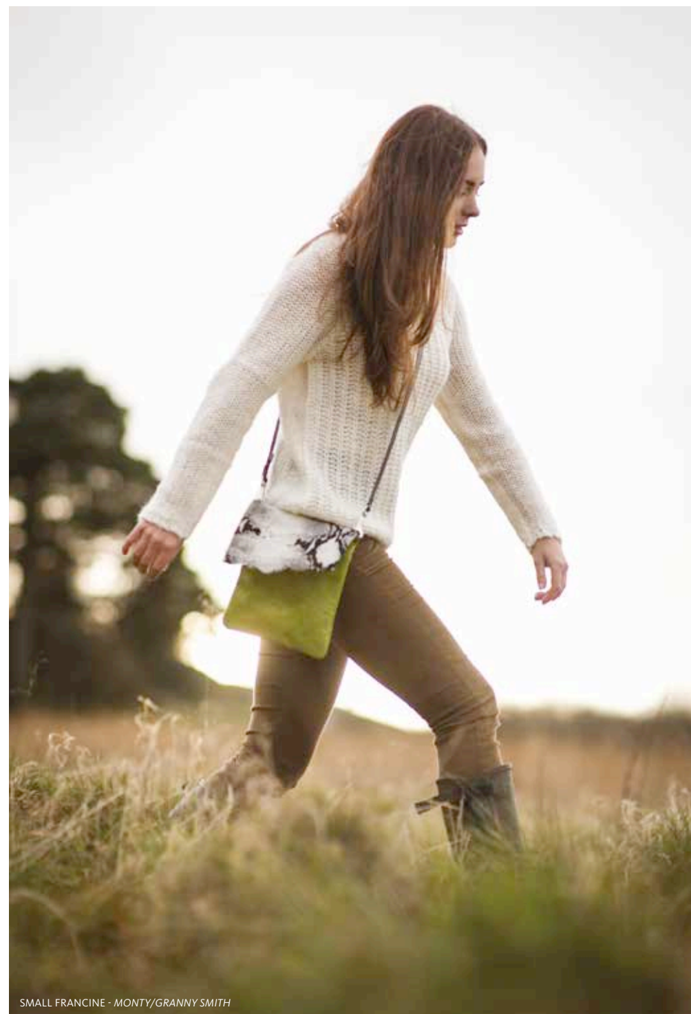
SMALL FRANCINE - MONTY/GRANNY SMITH