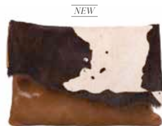
VIENNA - BROWN SPLASH / CURIO This Bohemian clutch is an easy way to inject any outfit with a unique twist - sensational. H21, W29cms Skins Available: Lg, Lc, H

Shown in STARS AND HEARTS Precious and tactile, give your keys the sophistication they deserve (sold in packs of ten). H8, W8cms Skins Available: Su, Lg, Lc, H