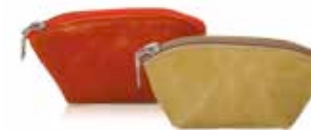
BOHO SMALL - ASSORTED LEATHER Funky and fun, very tactile zip top purse, just big enough for the essentials (sold in packs of ten). H7, W12, D4cms Skins Available: Su, Lg, Lc, H