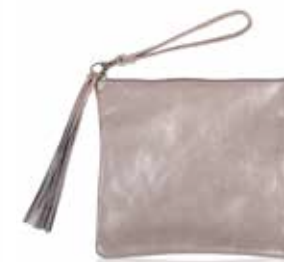
EDOBA - FRIGATE Clever zip clutch, holds an iPad Mini. Available in tassel or wrist strap options. H19, W21 Skins Available: Su, Lg, Lc, H