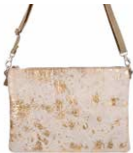
THRUSTON - GOLD ACIDO Contemporary zip top cowhide leather combo. The choice of all fashionistas – a must have in every wardrobe. H21, W29cms Skins Available: Lg, Lc, H

Our bags are available in a range of skin combinations Su: Suede | Lg: Leather Glacé | Lc: Leather Classic | Bi: Bison Leather | H: Hair-on