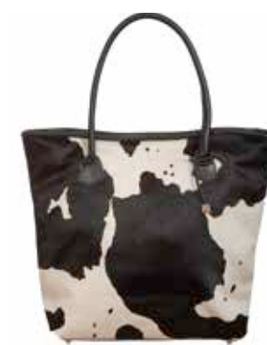
BARRINGTON - BLACK SPLASH

H37, W41, D10cms Skins Available: Su, Lg, Lc, Bi, H