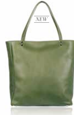
KENZIE - AVOCADO

H40, W38, D10cms Skin Available: Veg-Tan Only