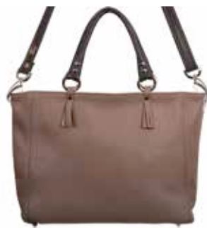
OLLIE - MUSHROOM

H24, W35, D15cms Skins Available: Su, Lg, Lc, H