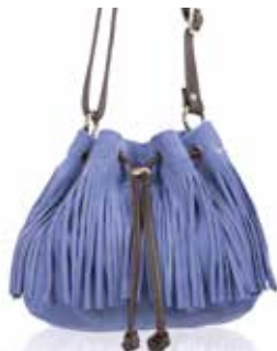
MADISON FRINGE - LAVENDER

H22, W34, D10cms Skins Available: Su, Lg, Lc, H