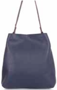
MISTIE - LIBERTY

The optimum mid-size shoulder bag - Chic, well balanced, it has a real charm and grace.