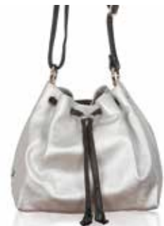
MADISON - SILVER

H20, W27cms Skins Available: Su, Lg, Lc, H