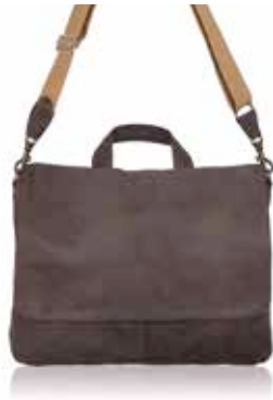
DJ - IROKO

The most desirable zipper document work bag – so much more than the average. Make a statement with this bag – the person carrying it is most certainly going places.