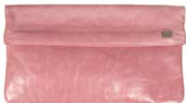
KINGS - ROSA A clutch bag, that will hold an iPad. Clean, understated but sophisticated, features a concealed hinged snap. H25, W31cms Skins Available: Su, Lg, Lc, H