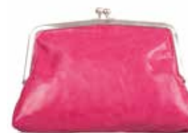
SOMER - FUCHSIA Neat clip top clutch – the essence is in the sleek streamlined cut but concealing a capacious interior. Elegant and secure. H18.5, W26, D7cms Skins Available: Lg, Lc, Bi, H