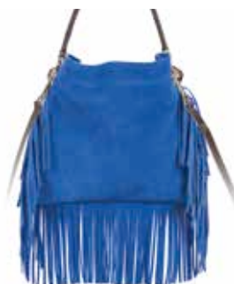
IGGY FRINGE - COBALT Sensual and sexy, we have added an opulent fringe to this Owen Barry Classic. H28, W30cms Skins Available: Su, Lc