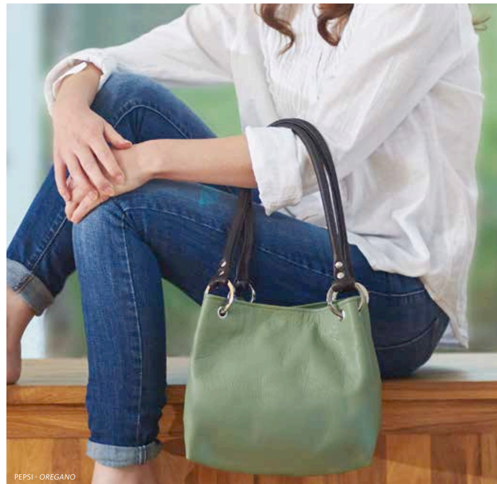
PEPSI - OREGANO

H29, W37, D14cms Skins Available: Su, Lg, Lc, H