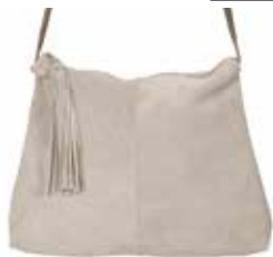
BELLA - SILVER GREY

A surprisingly capacious, light weight, zip top slouch bag. Adjustable strap cross body with removable tassel. The business bag that loves to party.