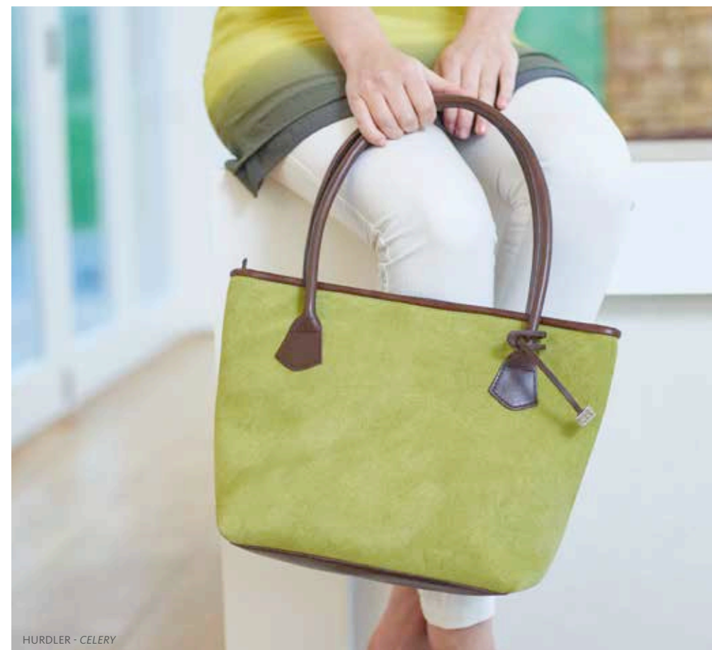
HURDLER - CELERY

H32, W41, D14cms Skins Available: Su, Lg, Lc, H