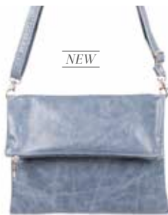
UTOYA - PERCY Smart & Sleek, a zipper cross body/ clutch with detachable and adjustable strap - superb. H18, W24cms Skins Available: Su, Lg, Lc

Small = H23, W21cms Large = H34, W30cms Skins Available: Su, Lg, Lc