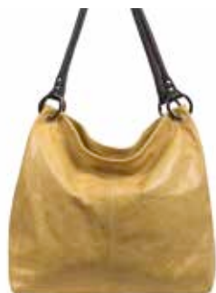
COXLEY - LEMON

Our bags are available in a range of skin combinations Su: Suede | Lg: Leather Glacé | Lc: Leather Classic | Bi: Bison Leather | H: Hair-on