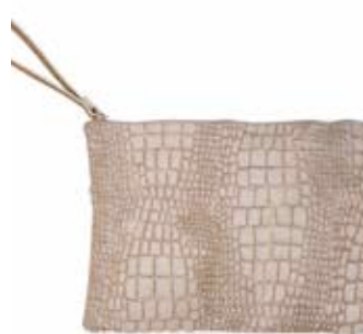
BAMBI - ARIEL The perfect size zipper clutch. This bag rocks – love it, love it, love it! H20.5, W28cms Skins Available: Lg, Lc, Bi, H

Our clutches and purses are available in a range of skin combinations Su: Suede | Lg: Leather Glacé | Lc: Leather Classic | Bi: Bison Leather | H: Hair-on