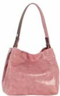
PUPPIE - ROSA

One of our bestsellers! A real head-turner, lightweight and an easy fit under the arm.