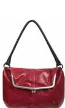
URBAN - RED

Our bags are available in a range of skin combinations Su: Suede | Lg: Leather Glacé | Lc: Leather Classic | Bi: Bison Leather | H: Hair-on