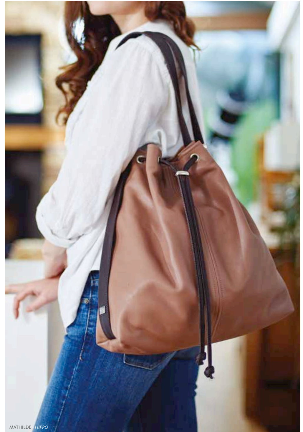
MATHILDE - HIPPO

H41, W44, D10cms Skins Available: Su, Lg, Lc, Bi, H