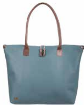
MONACO - KNOSSOS

H34, W34, D12cms Skins Available: Su, Lg, Lc, H