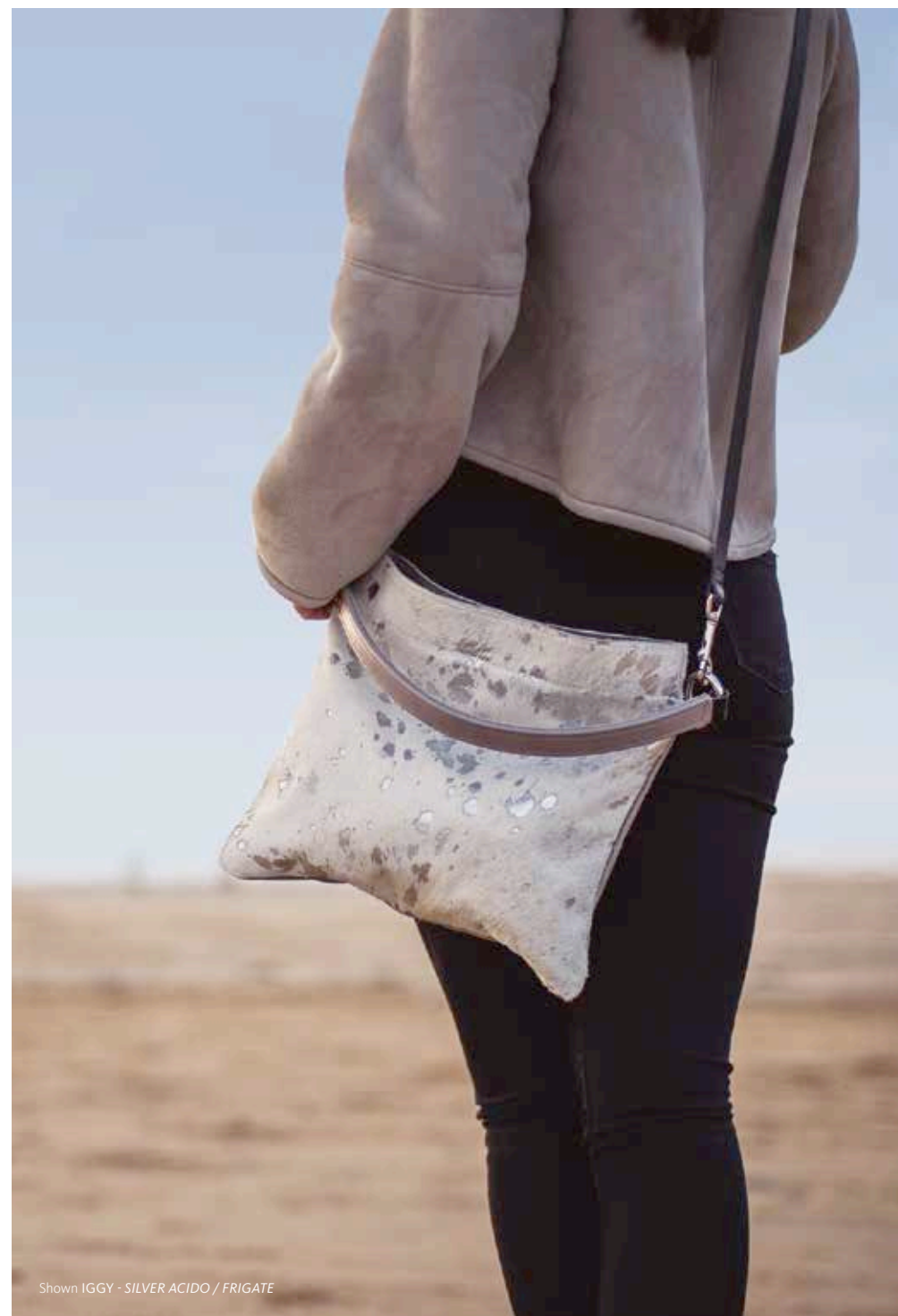
Shown IGGY - SILVER ACIDO / FRIGATE

H38, W26, D10cms Skins Available: Lg, Lc