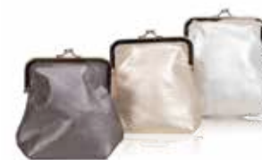
COIN PURSE - LEATHER Ideal handbag tidy for loose change or to keep those special/secret things safe. H15, W11, D6cms Skins Available: Su, Lg, Lc, H