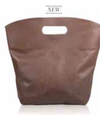
EGAN - BIRCH

With sculptured lines and gracious dimensions Egan is a very special handbag which benefits from a detachable cross body strap.