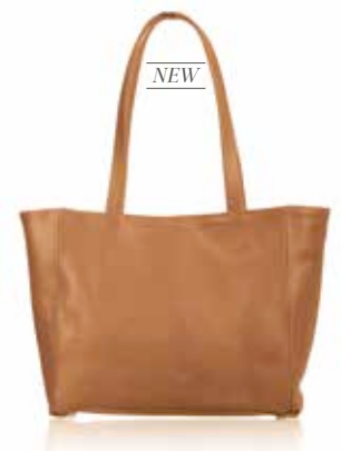
FINN - TOAST

H36, W32, D8cms Skin Available: Veg-Tan Only