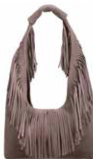
ARNIE - TORNADO

H41, W44, D10cms Skins Available: Su, Lg, Lc, H