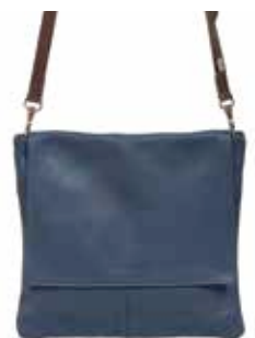
SASSIE - STAFFORD

H22, W34, D10cms Skins Available: Su, Lc