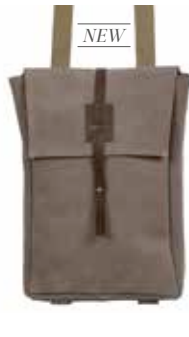
BIKER - TORNADO

H33, W50, D30cms Skins Available: Lg, Lc, H